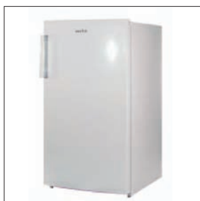
Refrigerator ARCTIC FB155 EUR 36.00 Code: 025.010.020.198