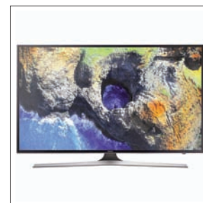
TV SAMSUNG UHD EUR 85.00/day (diagonal screen: 163 cm) Code 025 010 130 047