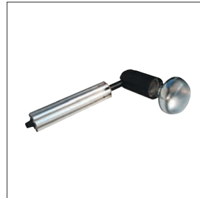
Connecting spotlight OCTANORM EUR 21.00 Code 019.010.187.000