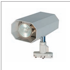
Halogen spotlight 100W SY STAR 50W (A) EUR 24.00 Code 019.010.186.000