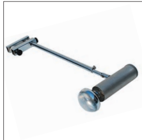
Arm spotlight 100W EUR 21.00 Code 019.010.181.000