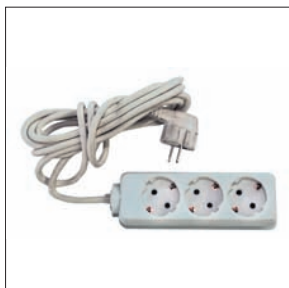
Extension cable, 230 V, 10A, 3m EUR 18.00 Code: 019.010.277.000