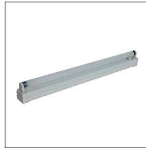
Fluorescent lighting SS30 type with D-170-A tube EUR 27.00 Code 019.010.190.001