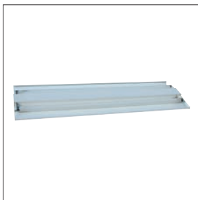
Fluorescent lighting OCTANORM type with double-tube D-171 EUR 29.00 Code 019.010.200.000