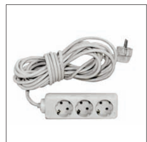
Extension cable 230V, 10A, 5m EUR 18.00 Code 019.010.279.000