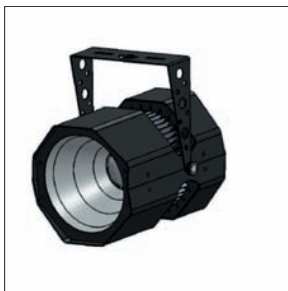
LED VIRGO reflector EUR 55.00 40W 4350 LM 4100 K Code 019.010.200.045