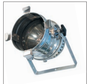
PAR64 500-1000W reflector EUR 55.00 Code 019.010.200.020