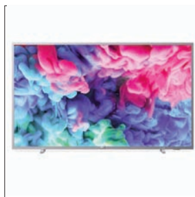
TV LED SMART 4K, UHD ultrathin EUR 55.00/day (diagonal screen: 126 cm) Code 025 010 130 045