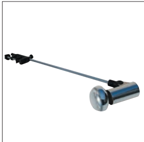
Arm spotlight EUR 21.00 Code 019.010.180.000