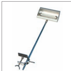
Arm reflector 300W EUR 50.00 Code 019.010.200.010