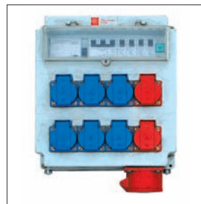
Electrical panel Octanorm EUR 210.00 Code 019.010.275.000