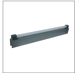
Fluorescent lighting SS30 type with D-170 tube EUR 24.00 Code 019.010.190.000