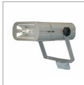
IVEN HQI 150W reflector EUR 50.00 Code 019.010.200.005