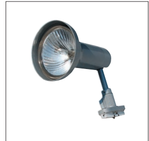
Halogen spotlight SY STAR EUR 24 cod 019.010.185.000