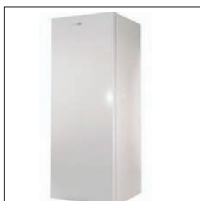
Refrigerator ARCTIC 2551 EUR 80.00 Code: 025.010.029.199