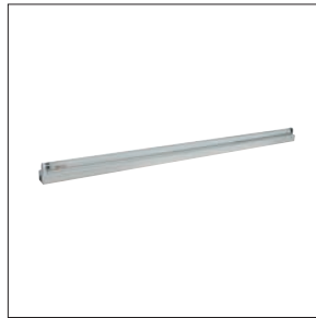
Fluorescent lamp FIA with complete electric installation 1x40W EUR 24.00 Code 019.010.110.000